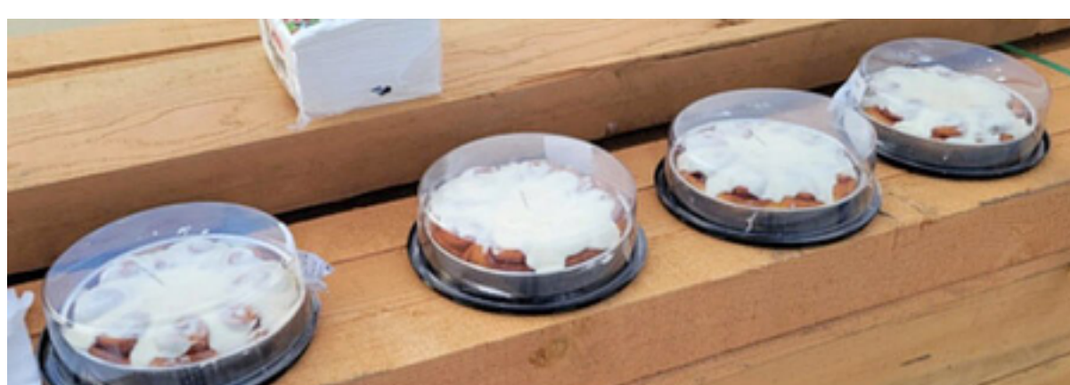
Yummy treats to show appreciation for the construction workers.