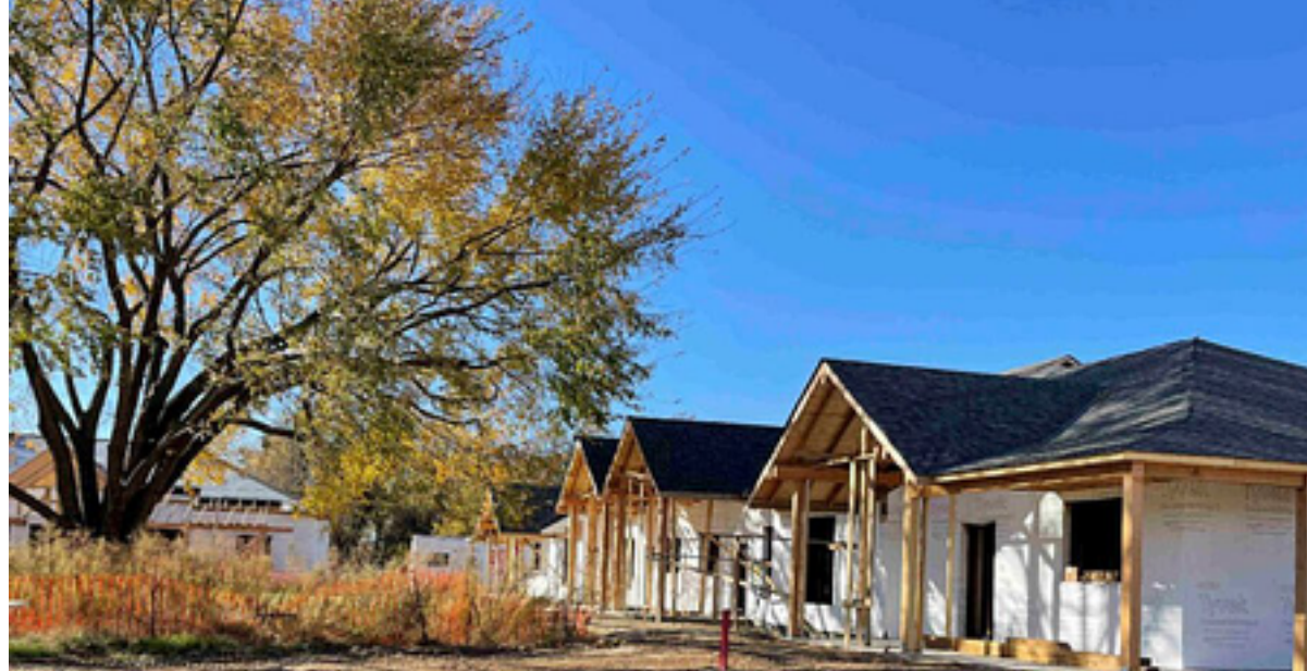
Fall comes to Heartwood Commons.

At our November site visit you can literally hear the excitement! Click HERE to listen